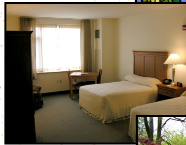
Spacious guest room