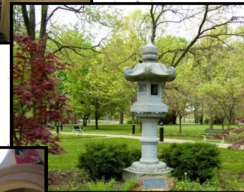
300 scenic acres